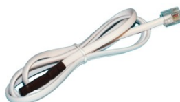
Temp-1Wire 1m 600 242