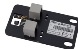
HTemp-Rack19 600 330