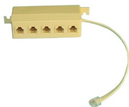
Poseidon T-Box 600 040