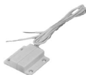
Door Contact 600 119