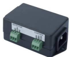
PowerEgg 600 237