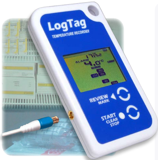
Part codes TRED30-7R, TRED30-7F

The LogTag® TRED30-7 Temperature Recorder measures and stores up to 7770 temperature readings over -40°C to +99°C (-40°F to +210°F) measurement range from a remote temperature probe.